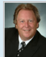
Dennis Street , AMP Residential and Commercial Mortgages M08000954

Figures are rounded to the nearest $100. This table assumes a mortgage interest rate of 8 per cent, average tax and heating costs in Canada, and the mortgage an average Canadian would qualify for based on a 32 per cent debt service ratio.